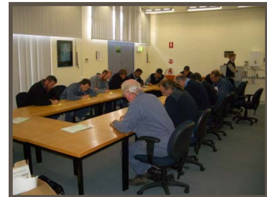
Men's Health in the Workplace