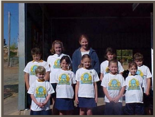
Walk Safely to School