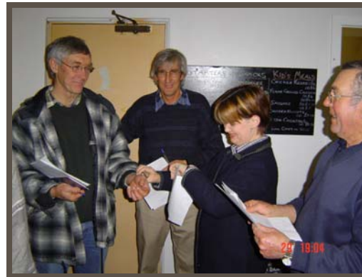
Men's Health Night