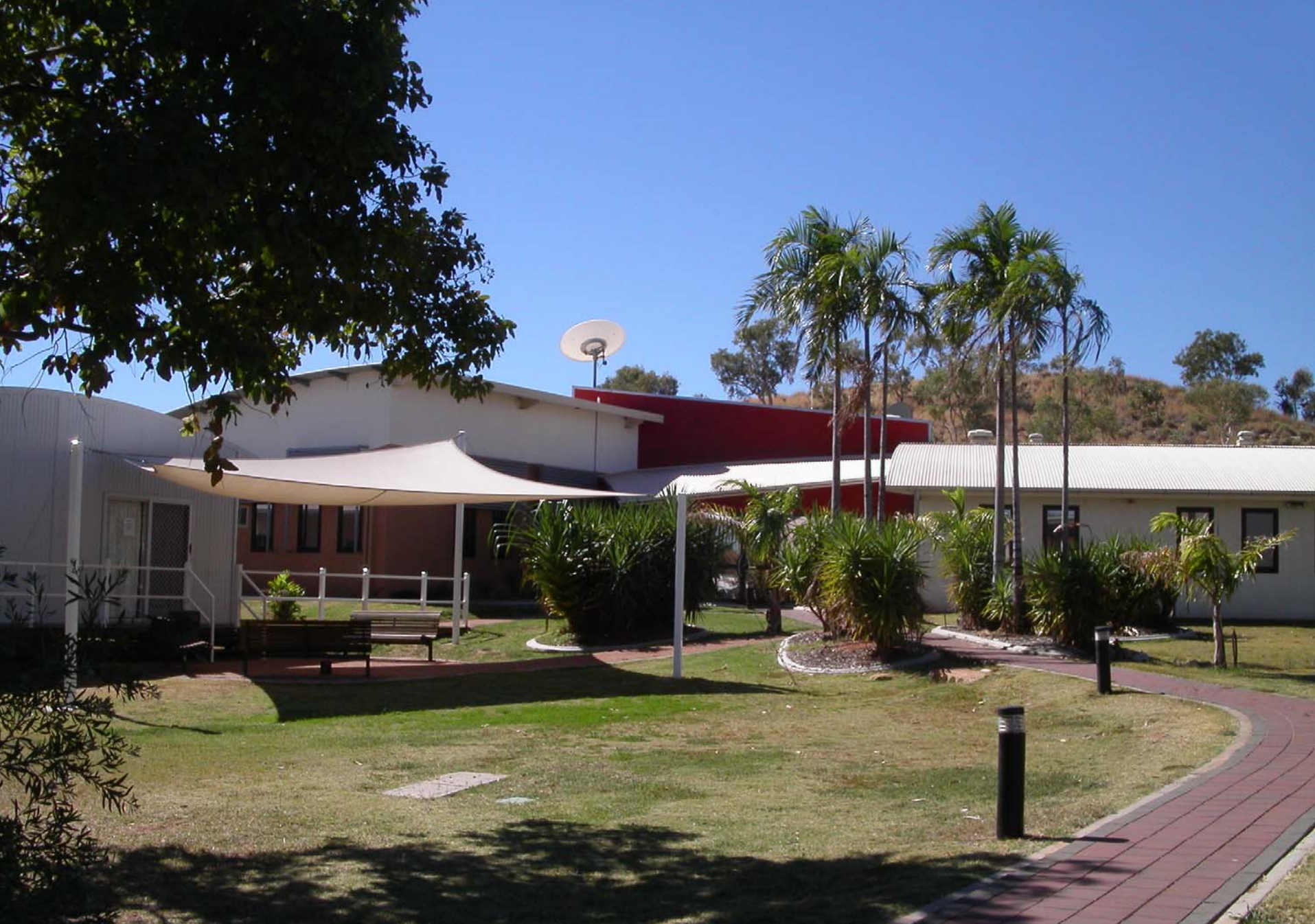
Mt Isa Centre for Rural and Remote Health