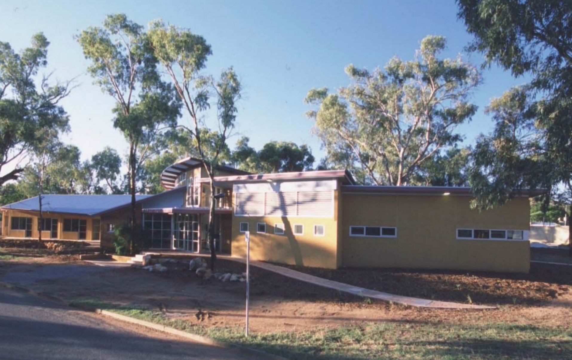
Centre for Remote Health, Alice Springs